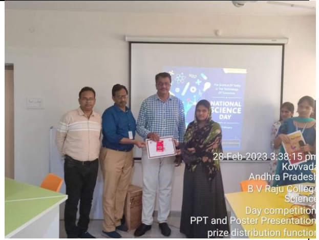
28-Feb-2023 3:38:15 pm Kovvada Andhra Pradesh B V Raju College Science Day competition PPT and Poster Presentation prize distribution function