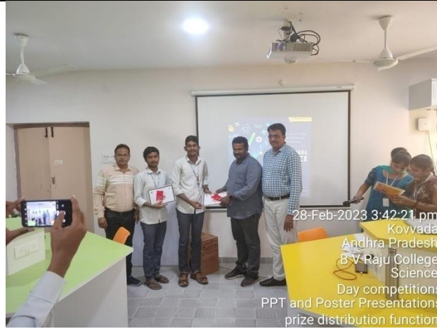
28-Feb-2023 3:42:21 pm Kovvada Andhra Pradesh B V Raju College Science Day competitions PPT and Poster Presentations prize distribution function